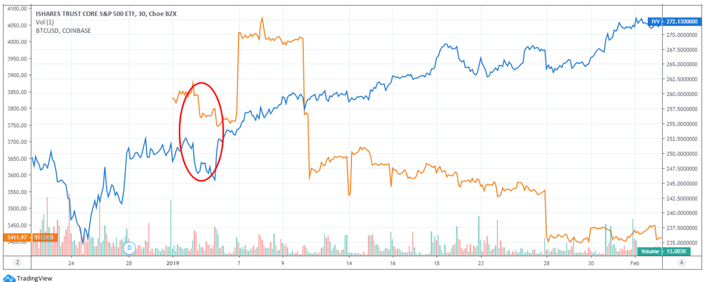
FIGURE 5 – JAN 3, 2019: APPLE EARNINGS WARNING

While the preceding analysis focused on our statistical measurements of multiday stock market drawdowns, anecdotally we've noticed increasing intraday inverse correlations with Bitcoin and the stock markets - a measure that suggests Bitcoin is increasingly being used as a macro risk off instrument. In the following charts we isolate news that drove downward movement in the stock market, but that also appears to cause price fluctuations in the price of Bitcoin. This is by no means a statistical study, but something we've noticed by carefully studying price movements. The first example, the Apple earnings warning, is an example of how the stock market and Bitcoin were positively correlated, but that gradually changes as we go throughout the year. Blue is the price of IVV (RHS axis), orange is the price of Bitcoin (LHS axis).