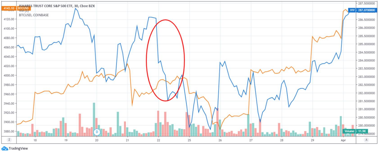
FIGURE 6 – MAR 23, 2019: YIELD CURVE INVERSION