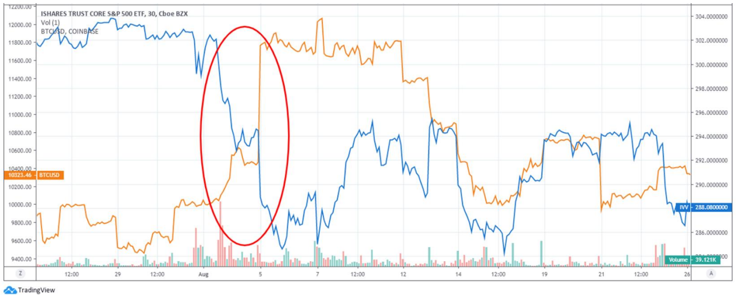
FIGURE 7 – AUG 3, 2019: US CHINA TRADE WAR HEATS UP