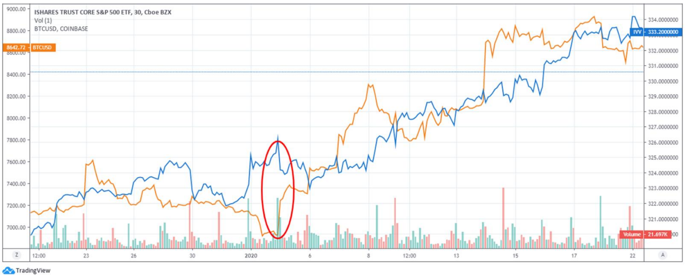
FIGURE 9 – JAN 3, 2020: US DRONE STRIKE IN IRAQ