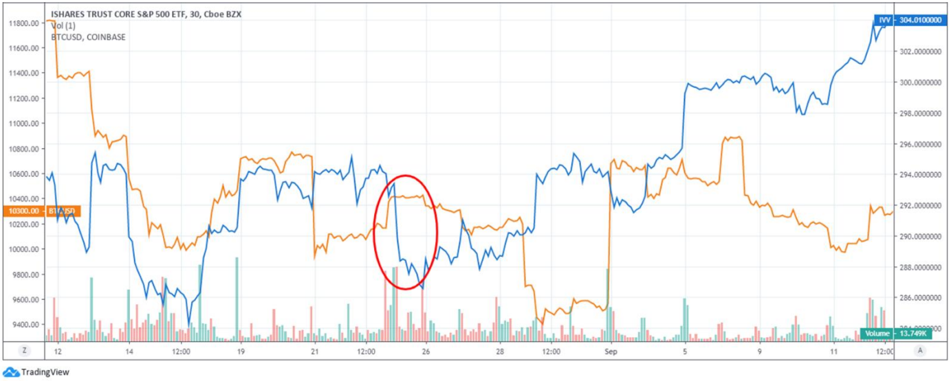
FIGURE 8 – AUG 23, 2019: CNHUSD (YUAN) BREAKS 7.0